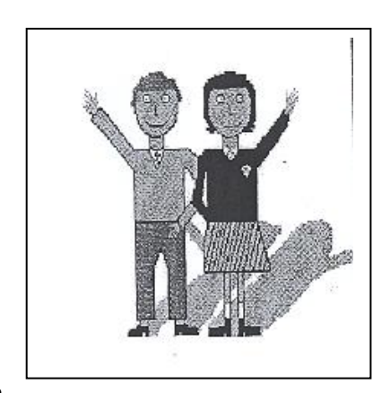
No jewellery No extreme hair styles

Please see our Uniform Policy on the school website.